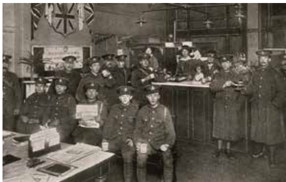
The interior of the Preston Sailors' and Soldiers' Free Buffet, 1916.

This is the room where the Free Buffet was located. By 1919 3 ¼ million soldiers and sailors had been guests of the buffet – men from all over the Empire. War worn and hungry, they arrived at the station and were supplied with refreshments day and night. Soldiers were offered blankets and pillows so they could sleep on wooden benches where a label was attached to them to alert the ladies of the time they needed to be woken.