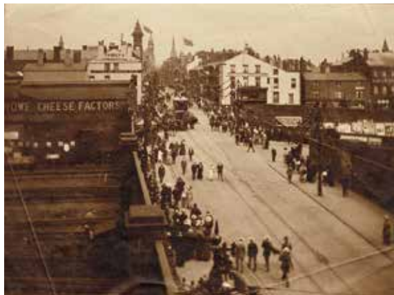
View of Fishergate with the clock tower of the Baptist Church showing on the left, 1913.