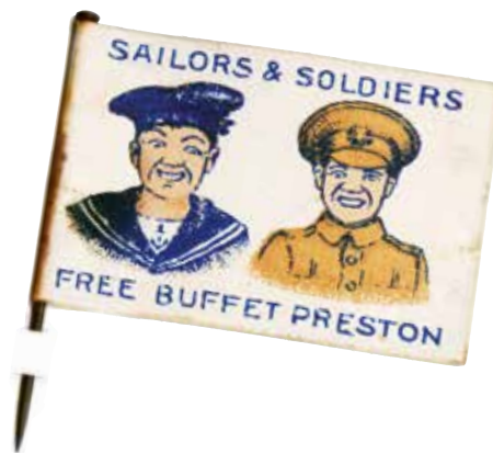
A pin sold to raise money for the Preston Sailors' and Soldiers' Free Buffet.

The Buffet also operated during the Second World War and 15 million cups of tea were given to troops who passed through Preston train station during both wars.