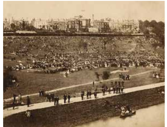
Avenham Park, showing the back of Ribblesdale Place, 1860s.